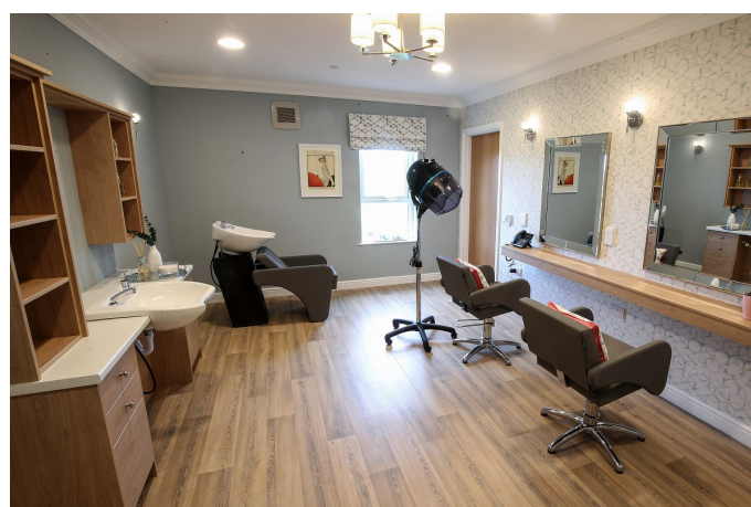
Sea Breeze Spa, a ladies and gents hairdressing service is available on the first floor, residents will also be able to avail of nail and beauty treatments.