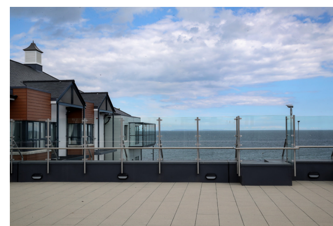
A spacious roof top garden with stunning sea views provides additional space for events, bowling and activities, or simply a place to sit and relax.