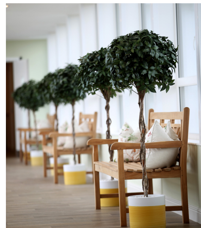
Walkway between two wings and leading onto the rooftop terrace