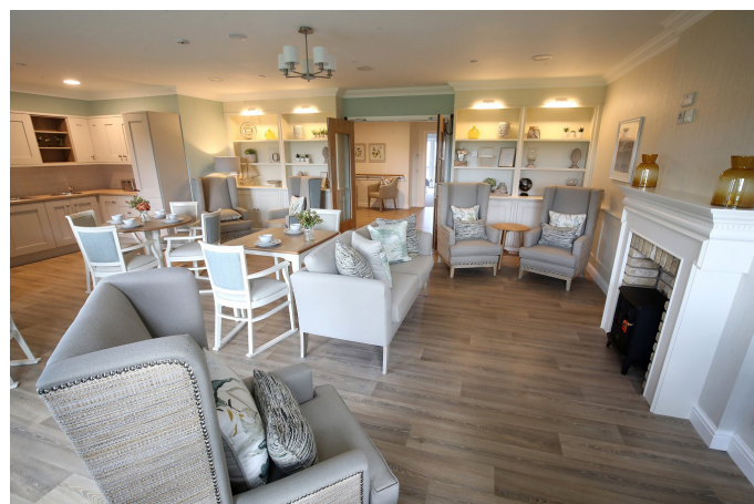
Each household of ten comes with its own lounge area and kitchenette, allowing for additional opportunities for socialising, relaxing, events and conversation.