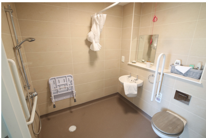
An en-suite wet room is in each bedroom

With a maximum capacity of only 60 residents, Copelands provides private en-suite bedrooms, with the majority enjoying views across the rolling drumlin countryside or out towards the Irish Sea.