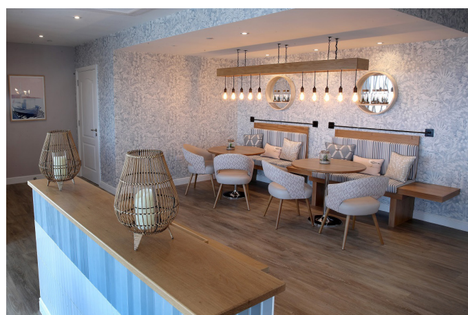
'Pebbles Café' A café-style socialising area which provides a pleasant environment for social occasions or family events such as a birthday party or just a social cuppa and a chat.