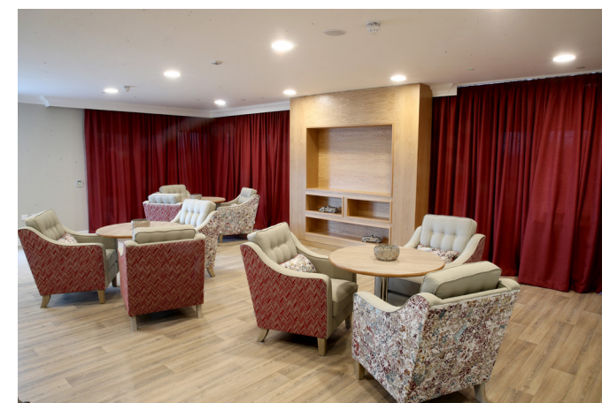
'The Hub' A common room adaptable for 'cinema nights', events and entertainment.

Activities take place daily and each resident receives a monthly Activity Programme to keep up to date with what is happening. Residents are also encouraged to run social activities and organise entertainment. The activities programme, for example, includes exercise programmes, a knitting club, BBQs, coffee mornings, film evenings, musical nights, sing-alongs, a craft programme, a baking club, gardening and much more.