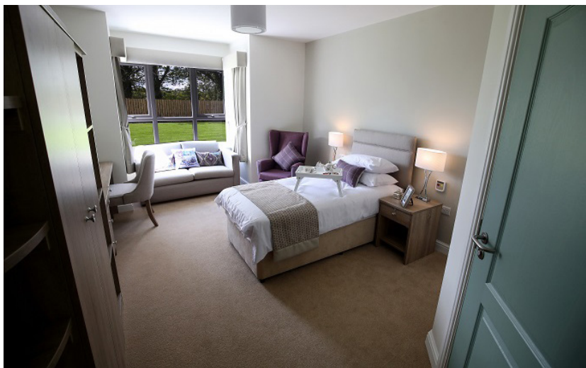
Bedroom with bay window