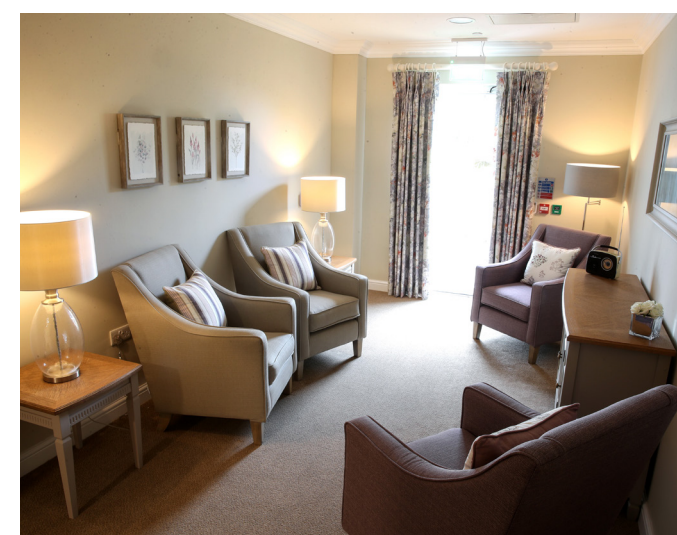
Quiet room, where residents can sit and read, play chess, do some knitting or just relax.