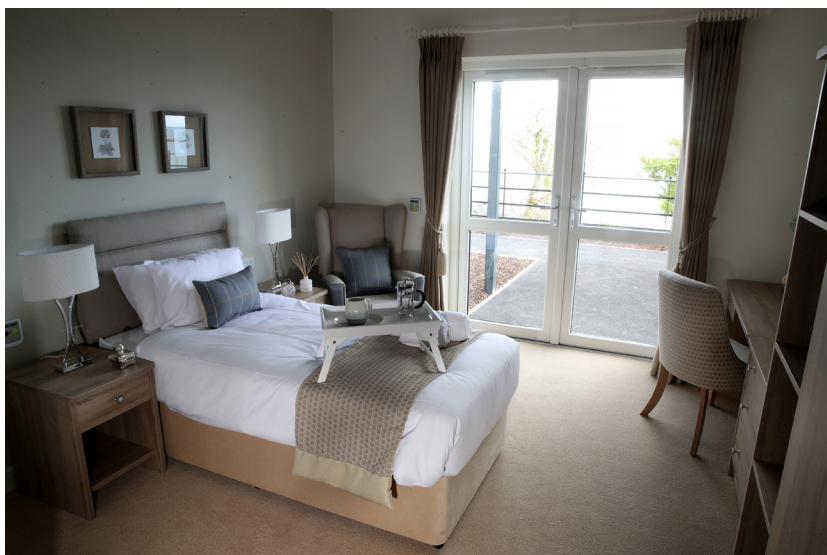
Bedroom with French windows and small terrace