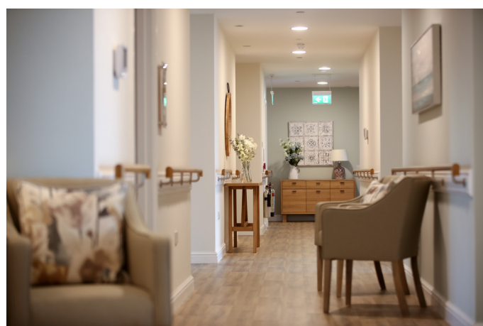
Corridors are spacious, homely and also places to sit and watch the world go by. Colours are relaxing and soothing.

Activities take place daily and each resident receives a monthly Activity Programme to keep up to date with what is happening. Residents are also encouraged to run social activities and organise entertainment. The activities programme, for example, includes exercise programmes, a knitting club, BBQs, coffee mornings, film evenings, musical nights, sing-alongs, a craft programme, a baking club, gardening and much more.