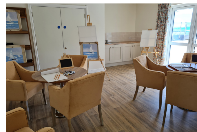
A dedicated room for hobbies, arts & crafts with access to the roof top terrace