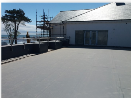
Roof top terrace with a view out to sea