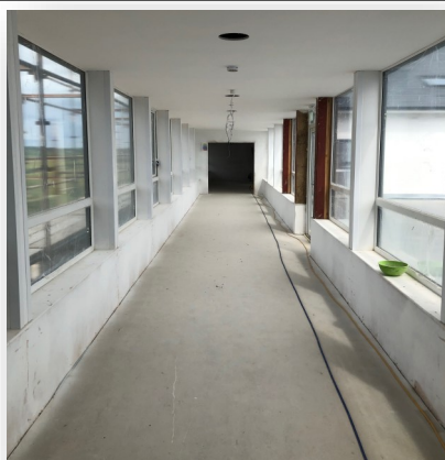
Covered walkway on the roof top terrace linking two of the wings and giving access to the terrace.

Away from the site, work is ongoing to prepare for the eventual opening, which is currently planned for early 2021. Recruitment for staff will now commence later in the year while those who have expressed an interest in residency (either for themselves or for a loved one) are being kept up to date with developments. We are also working on a new brochure and website while others are putting together induction packs for staff and other required official documentation.